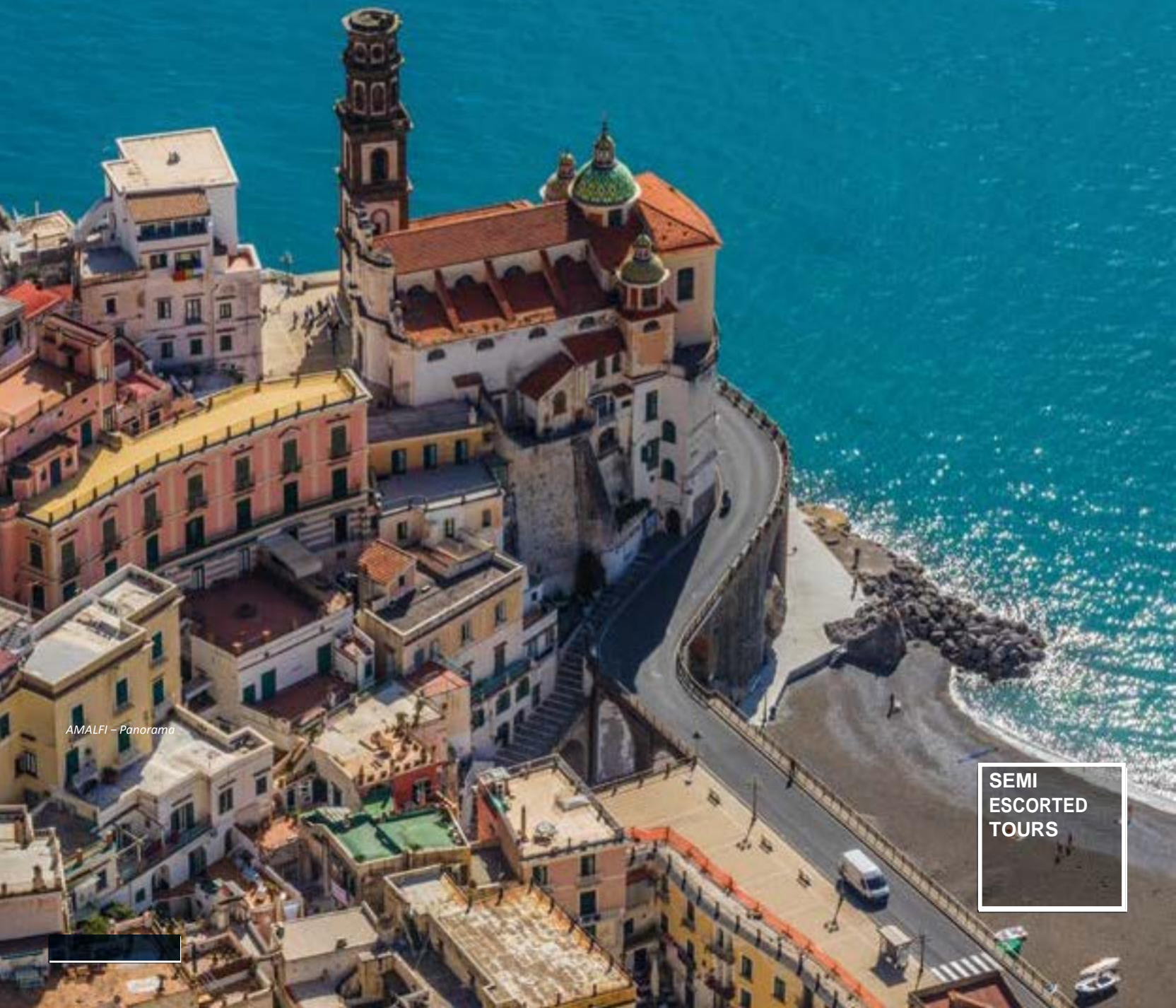
AMALFI – Panorama